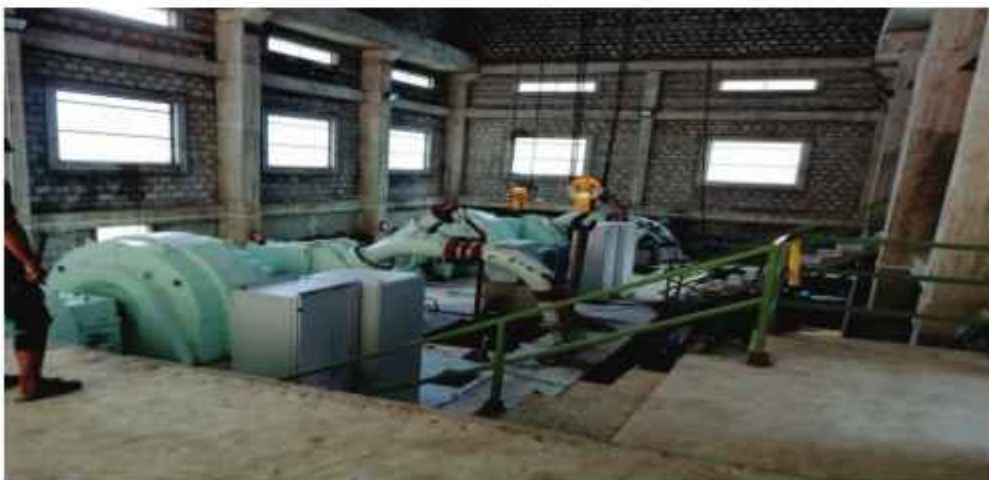
माथिल्लो मर्दी खोला जलविद्युत आयोजना (७ मे.वा)